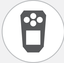
ALTAIR io 4