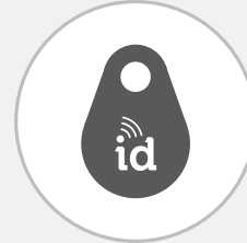
MSA id Tag